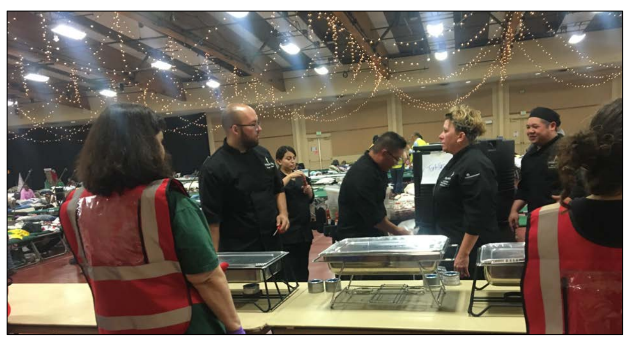
Below: The Epicurean Group relief team prepares to serve dinner at the Marin Center shelter.