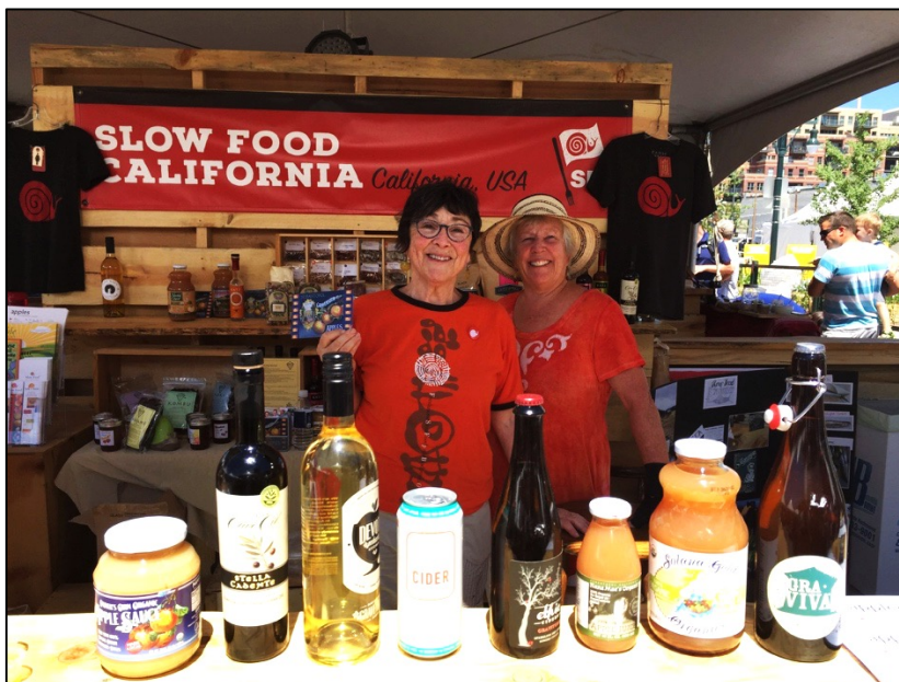
Local artisanal products made from heritage Gravenstein apples showcased at the Slow Food California booth.